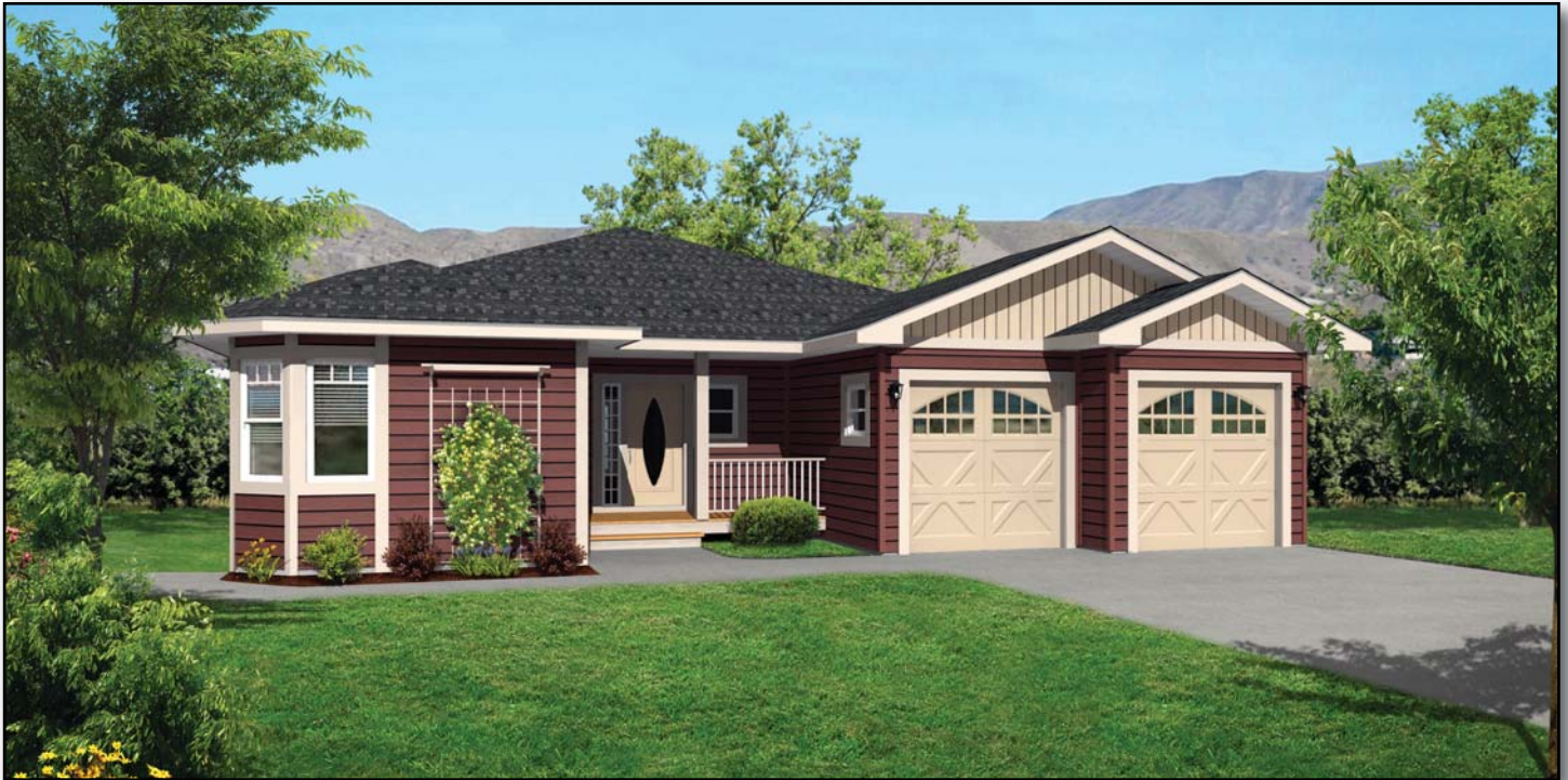
CTF-403 "The Morissey" 40'6" x 32'/38'/48' - 1,816 Sq. Ft.

Artist Renderings Optional Deluxe Exterior Shown Some features shown may be optional