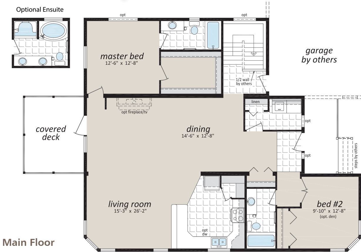
CTF-403 "The Morissey" 40'6" x 32'/38'/48" - 1,816 Sq. Ft.